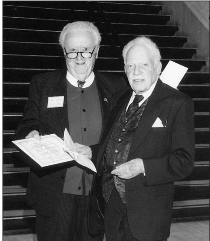
Fred with former Governor Lee Sherman Dreyfus at the WI Humanities Council Awards ceremony, Oct 8, 1999