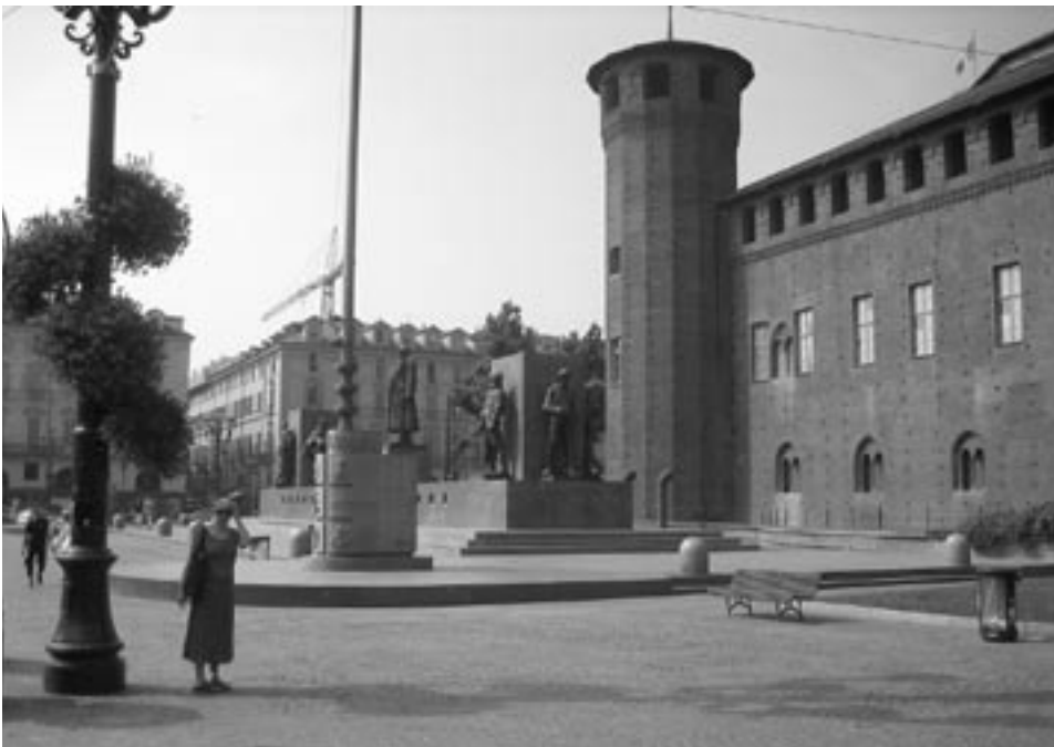
◀ DARE Editor Luanne von Schneidmesser stands in front of the Palazzo Madama in the Piazza Castello in Turin, Italy, where she attended the September 2006 EURALEX Conference.