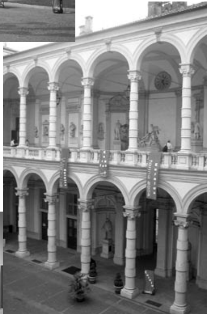
▼ The Aula Magna del Rettorato provided a beautiful setting for the opening address.