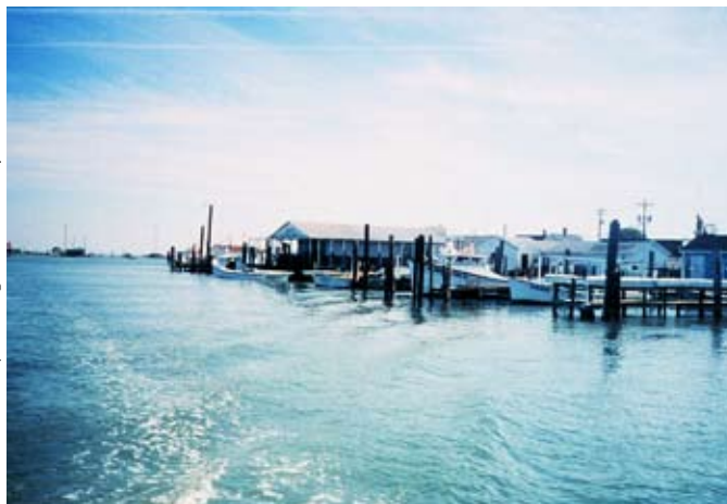
The harbor at Tangier Island